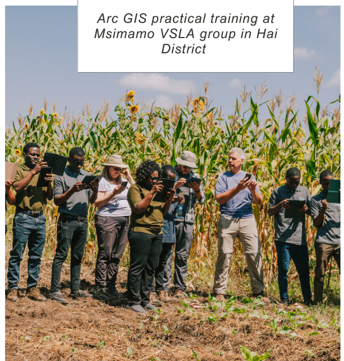
Arc GIS practical training at Msimamo VSLA group in Hai District

During the visit, watershed management and environmental restoration program officers received training on Arc GIS application in tracking and monitoring trees planted by Floresta Tanzania. The officers learned all features and practised practically using the app in the field.