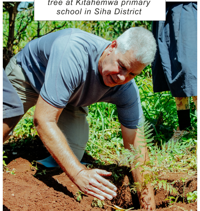
one of the guests, planting a tree at Kitahemwa primary school in Siha District

The guests saw the implementation and impacts of Economic Empowerment programs at Mafanikio VSLA group in Siha District. They heard from the group's chairperson and two members how the village saving and lending association (VSLA) have economically empowered them to pursue their priorities and transform their lives including buying motorcycles and strengthening their businesses.