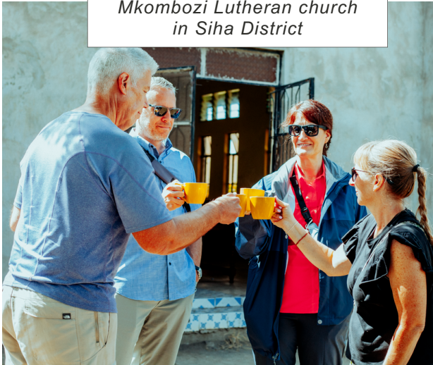
Sharing a cup of tea at Mkombozi Lutheran church in Siha District

At Kitahemwa Primary School, the guests saw the involvement of students in environmental restoration activities. They also heard from the head teacher how the avocado project, a product of grafted avocado training they received, benefits them and enables them to buy stationaries for the students. The guests planted trees at the school farm as a symbol of their visit.