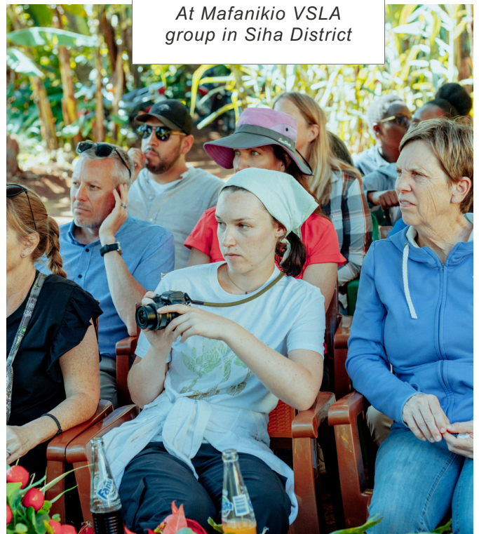
At Mafanikio VSLA group in Siha District

The guests saw the implementation and impacts of Economic Empowerment programs at Mafanikio VSLA group in Siha District. They heard from the group's chairperson and two members how the village saving and lending association (VSLA) have economically empowered them to pursue their priorities and transform their lives including buying motorcycles and strengthening their businesses.