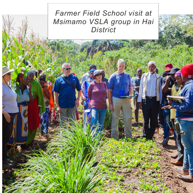
Farmer Field School visit at Msimamo VSLA group in Hai District

The visitors saw individual adaption and application of agroecological techniques taught in the groups and the impacts of the organization goat project by visiting one lead farmer who is also a goat beneficiary from Green VSLA group in Nkwansira village, Hai District. They saw the lead farmer's organic farm, his beekeeping project, and he explained how the goat project has socially and economically improved his life and enabled him to install water and electricity systems in his house.